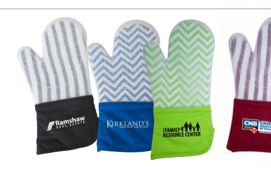
Frosted Silicone Oven Mitt